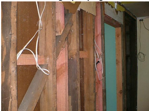
Once there was a 2-toilet block...