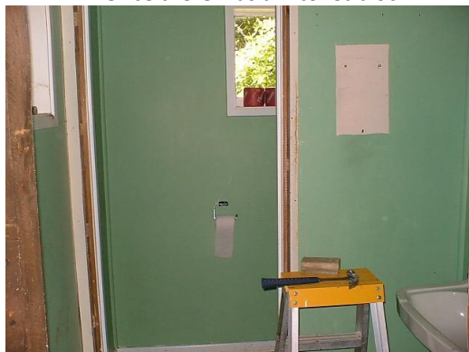
...that has now been removed in preparation for the installation of the new 5-toilet block and entrance to the back stage area.