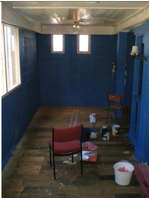
The foyer has been re-painted ready for new carpet to be laid and the red paint in the auditorium has been renewed. We have also painted the fire exits plus numerous other little jobs that needed to be done. Huge thanks to all the Friends who helped get the theatre ready for the builders to move back in.